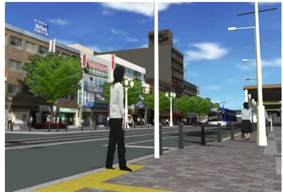
Fig. 5: Close up of rail stops [7].

An outstanding feature of this VR model is the extent to which it has been edited in order to relay the latest information to citizens. Beyond just a discussion of physical infrastructure changes, “planning” in this case has been research-intensive and includes a focus on process and involvement. University students have conducted surveys on both the public’s opinion of the project, and their feelings on the VR model itself. For example, Kawano at Utsunomiya University studied the amount of information (about the LRT) that subjects retained from the visualization. Subjects were first shown an image, followed by a written statement, followed by a simulation, and finally finished with a simulation that included sound [9]. Here we see not only concern for the LRT design as an end in itself, but also for the model to be used as a platform for experimenting with VR applications, and transferring technical knowledge to a public audience.