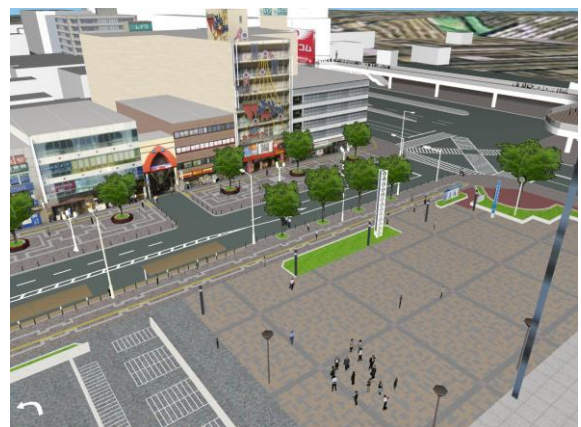
Fig. 6: Public gathering space near the station [7].