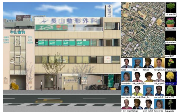
Fig. 3: Building and satellite textures, human and foliage models [7].