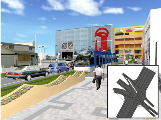
Fig.4: LRT, traffic and intersection drive paths editing window [7].

Human and animal moving models can be set to “flightpaths” and travel through the VR space. Motion-capture animations can be set to MD3 characters to allow them to move through the city space.