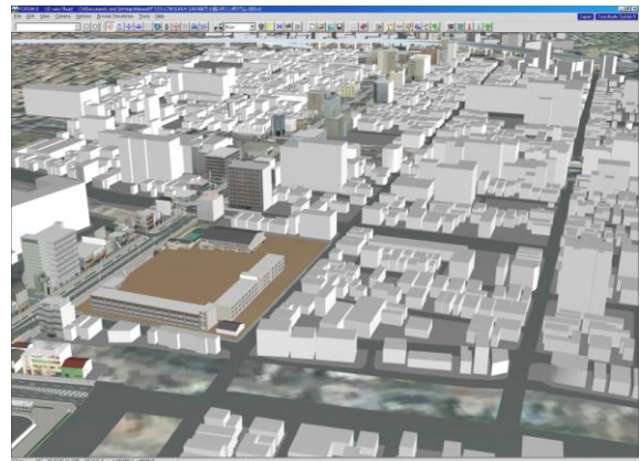
Fig. 2: 3D interface screenshot – overview of building models [7].