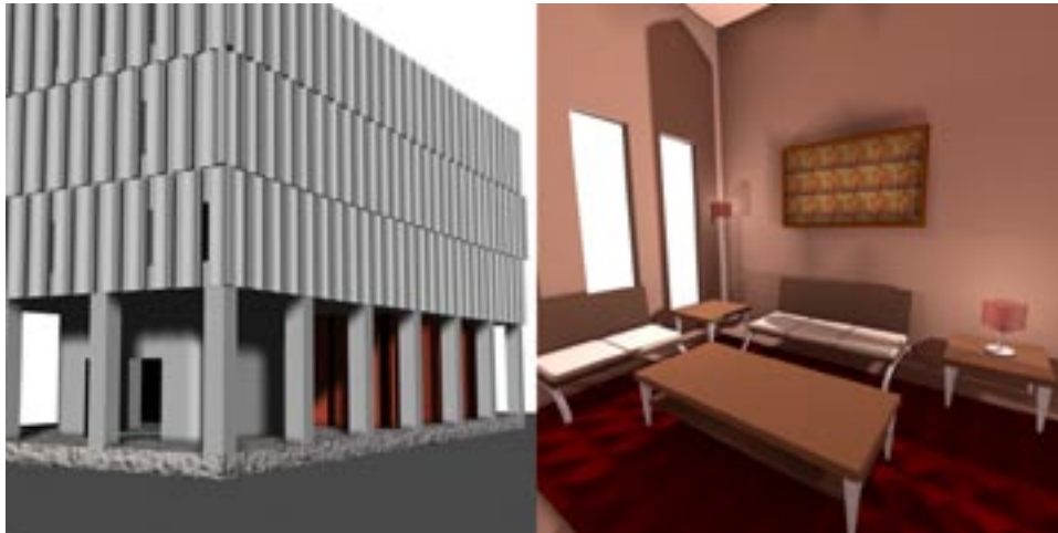
Figure 4: Output images of grade C