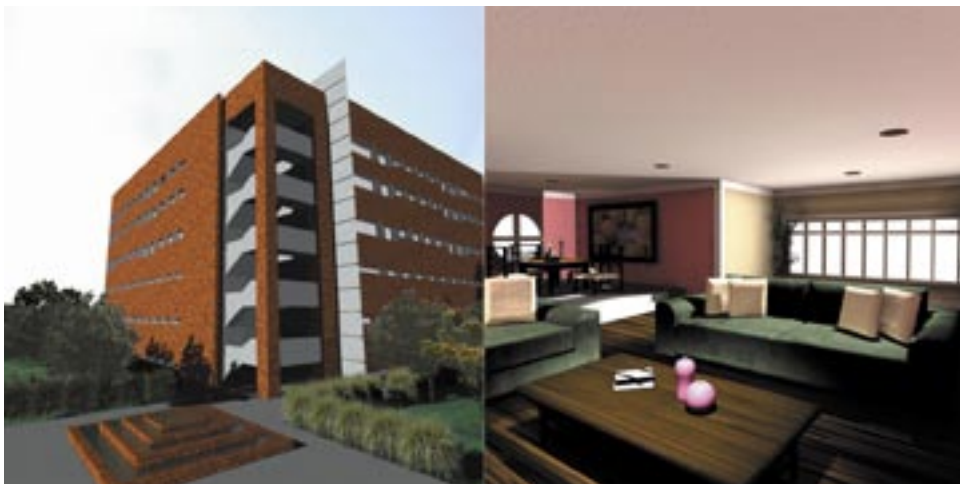
Figure 2: Output images of grade A