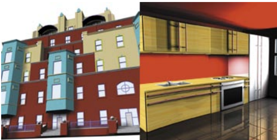
Figure 3: Output images of grade B