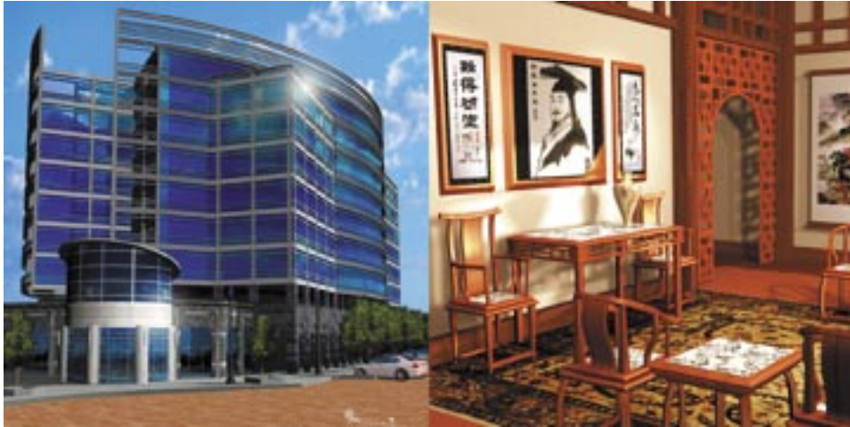
Figure 1: Output images of grade A+ (plus)